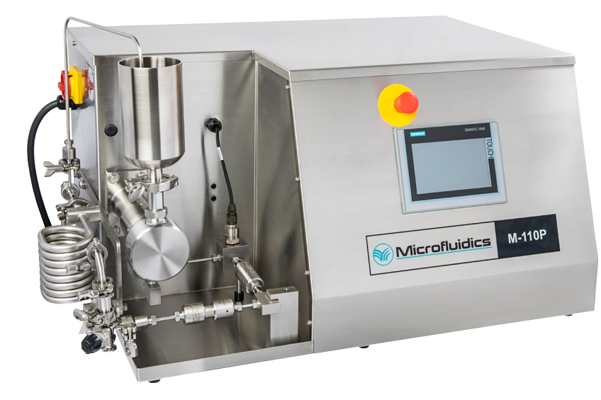
Model shown is subject to change depending on options selected.