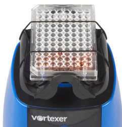
Assay plate x 1 (to be used with retention cords)