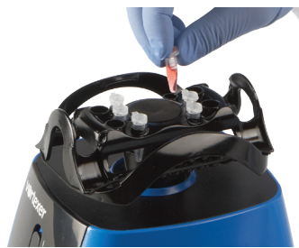
0.5 mL microfuge tubes x 6 (vertically mounted)