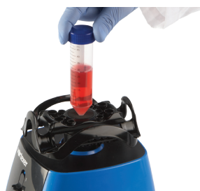
Center pad area for hand held mixing