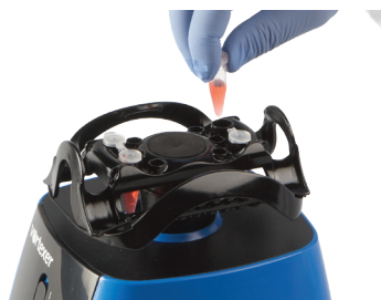
1.5/2 mL microfuge tubes x 4 (vertically mounted)