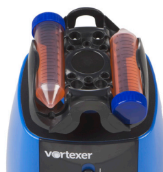
50 mL conical tubes x 2 (horizontally mounted)