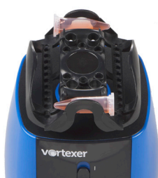
5 mL tubes x 2 (horizontally mounted in the same retention space as 15 mL)