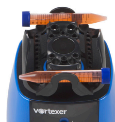
15 mL conical tubes x 2 (horizontally mounted)