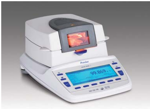
Compactly styled design