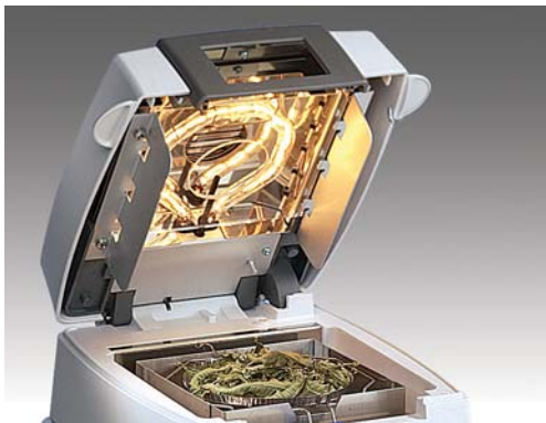
3 different heat sources are optional