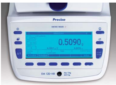
Outstanding graphic Display